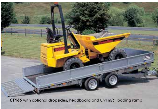
CT166 with optional dropsides, headboard and 0.91m/3' loading ramp