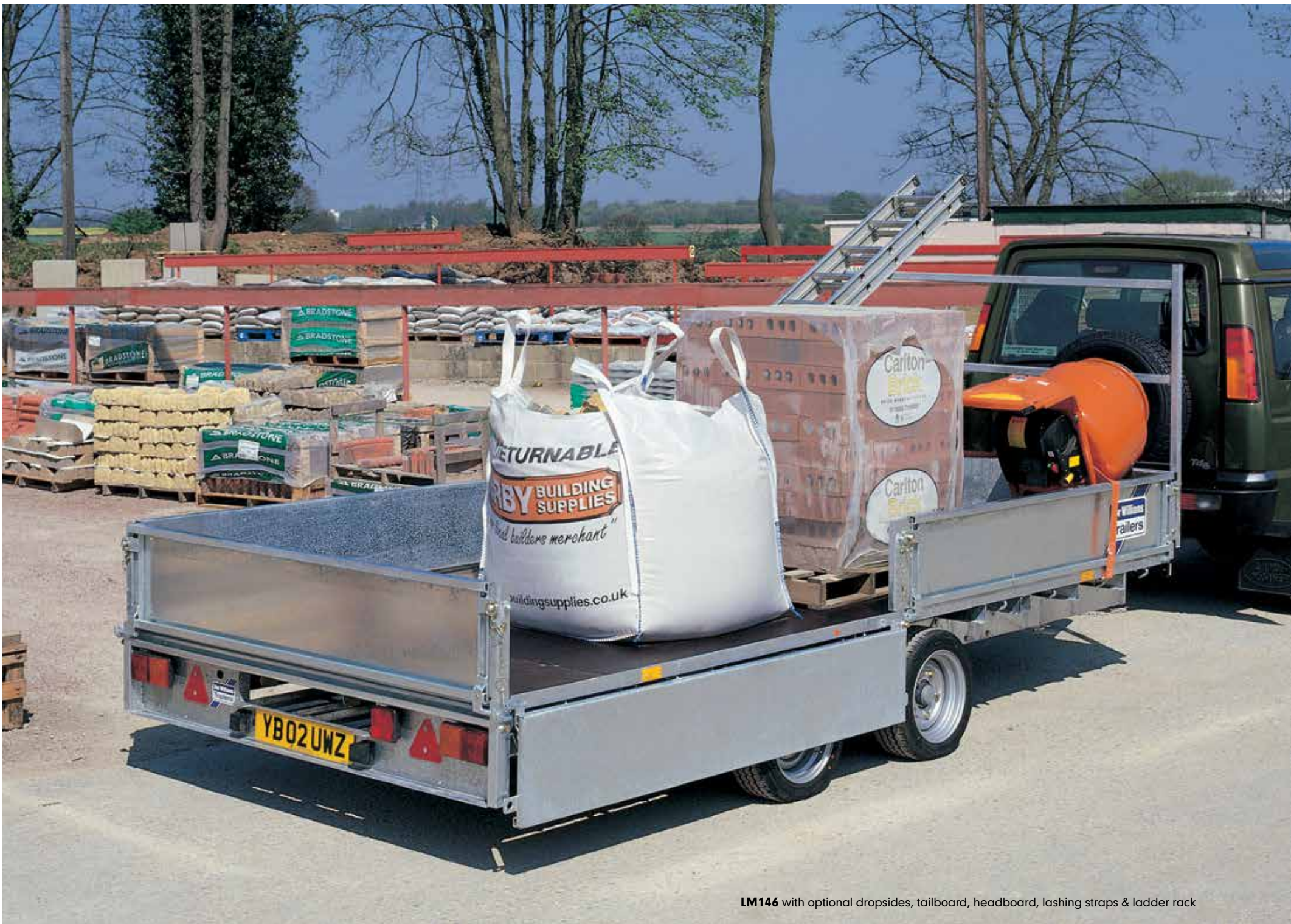
LM146 with optional dropsides, tailboard, headboard, lashing straps & ladder rack