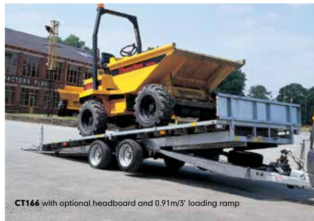
CT166 with optional headboard and 0.91m/3' loading ramp