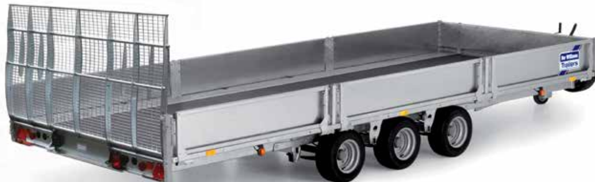
TB5521-353 with mesh rear ramp and drop sides.