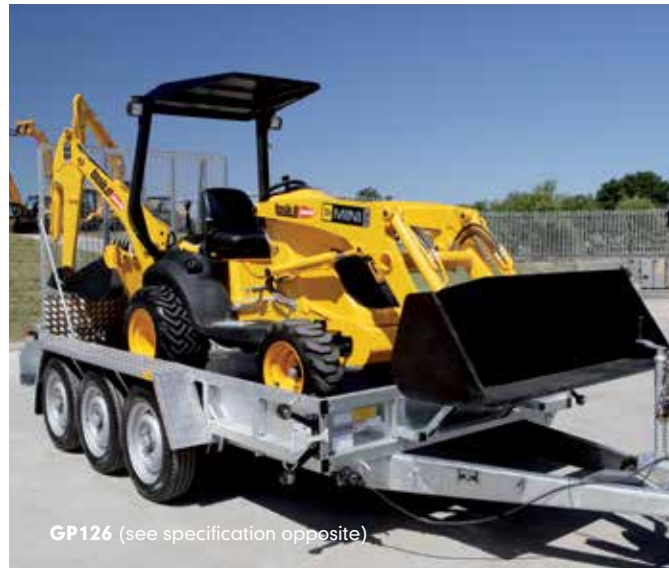
GP126 (see specification opposite)