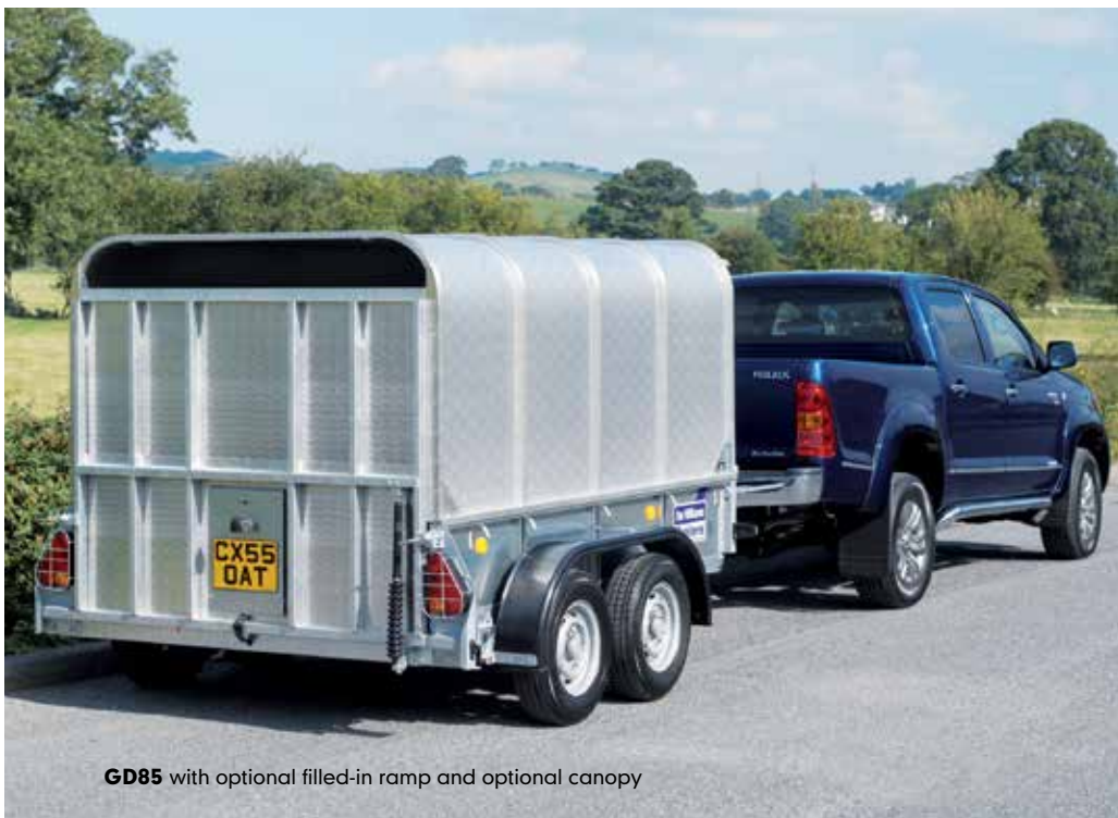
GD85 with optional filled-in ramp and optional canopy