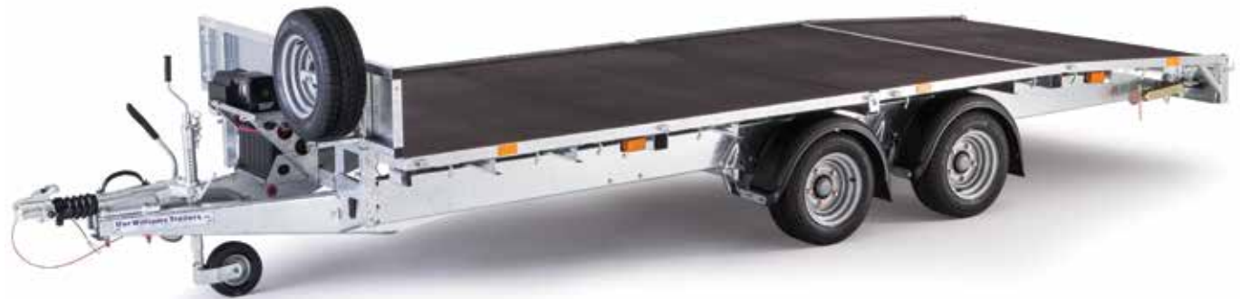
LM166/B with optional propstands

Vehicles with low ground clearance may not be suitable for loading on this type of trailer.