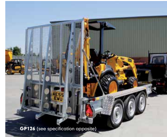
GP126 (see specification opposite)