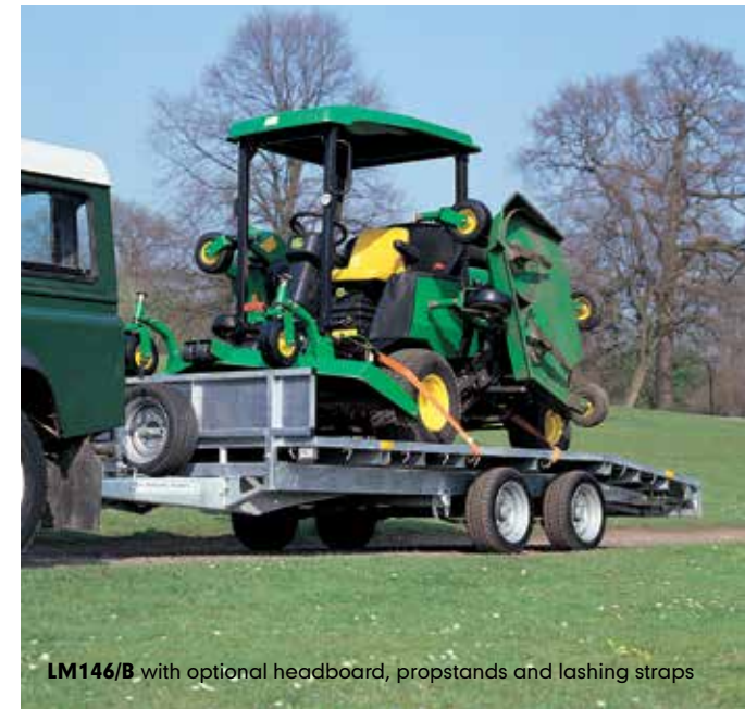
LM146/B with optional headboard, propstands and lashing straps