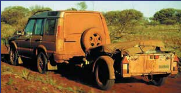
A GD64 at work in the Australian outback

Our General Duty trailers are at home in almost any environment, with virtually any type of load, from building materials to expedition equipment.