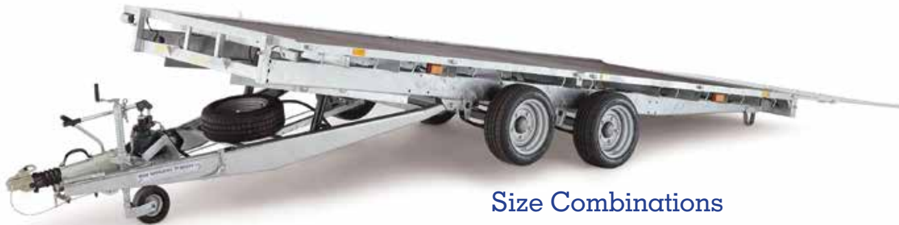
CT166 with optional 0.91m/3' loading ramp (0.3m/1' loading ramp comes as standard)