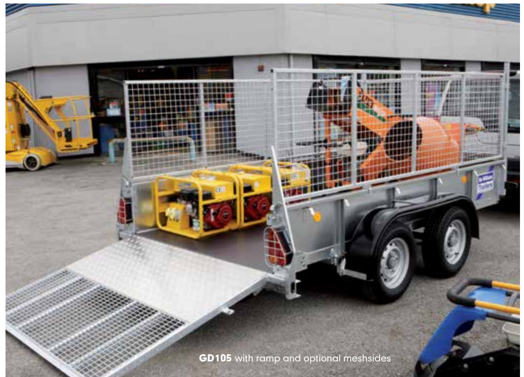
GD105 with ramp and optional meshsides